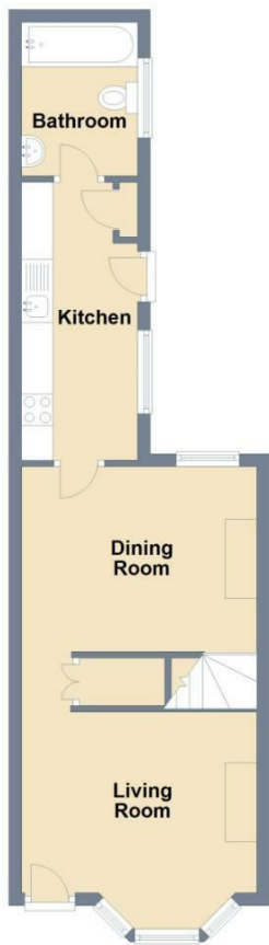
Ground Floor Approx. 39.1 sq. metres (420.7 sq. feet)